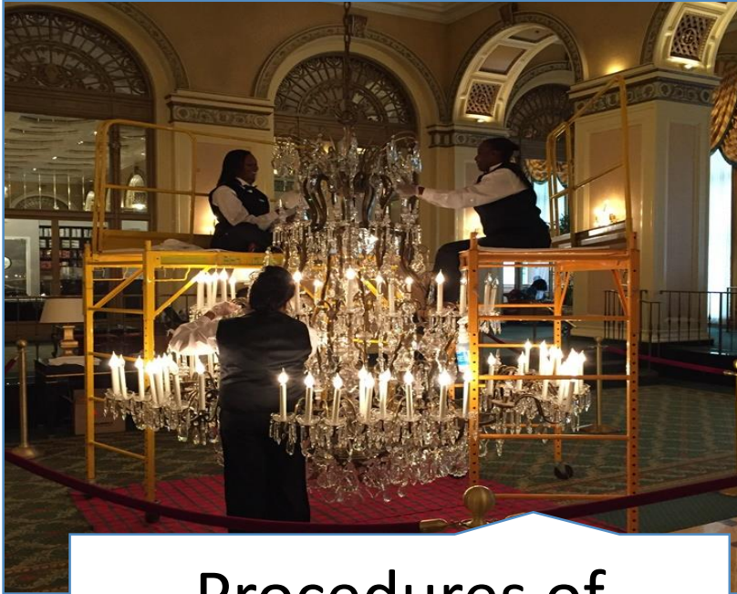
Procedures of ceilings cleaning