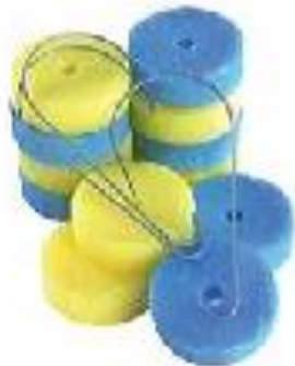
Toilet Rim Blocks