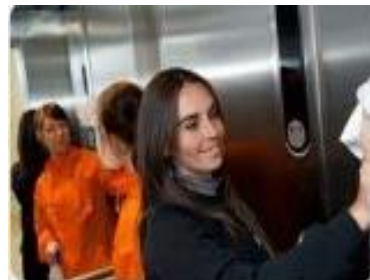
Elevators and escalators