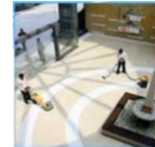
Lobby and Front Desk