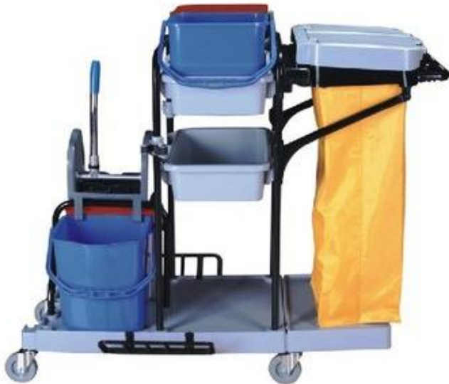
Public area cart