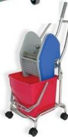
Mop wringer trolley