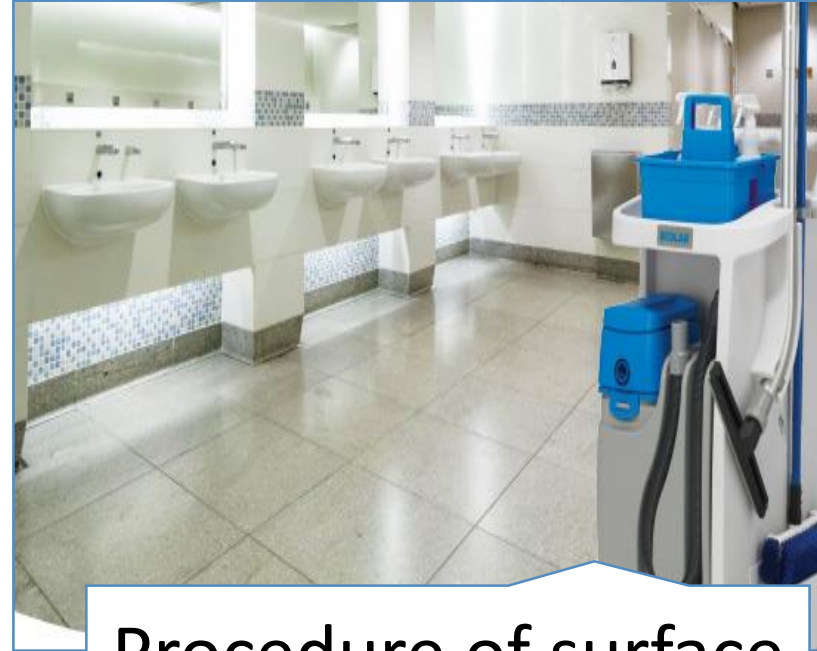
Procedure of surface washroom cleaning